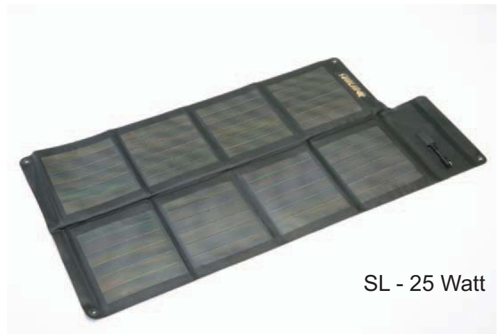
SL - 25 Watt

The I/V graph above shows the typical performance of the solar module at STC